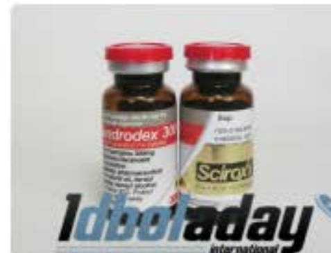
SCIROXX - Nandrodex 300mg/ml 10ml USA ONLY $114.21