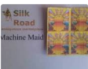
4 Orange sunshine 300ug $90.49