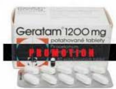
PIRACETAM tbl. 100x1200mg (nootropil) $92.64