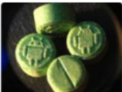
100x Green Android™ ( The New Mortal Kombat™ ) $547.65