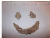
7 grams of PURE MDMA Moonrocks. $378.58