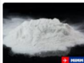
10.0g MDA - Reagent Tested $550.00