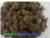
HYDRO BUDS 2G $40.00