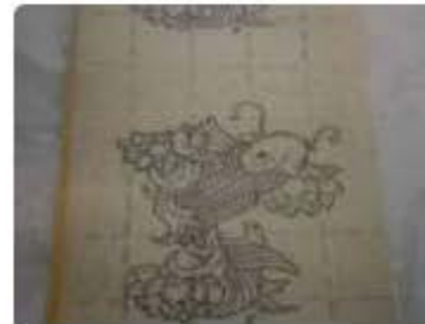
25X LSD BLOTTER $421.19