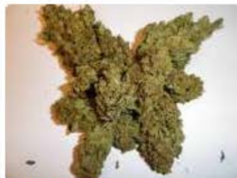
10g Amnesia Haze $194.77