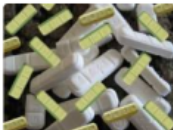
2mg Xanax Bars from Walgreens $5.42