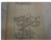
25X LSD BLOTTER $421.19