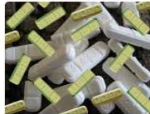
2mg Xanax Bars from Wallgreens $5.42