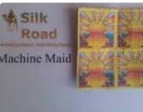
4 Orange sunshine 300ug $90.49