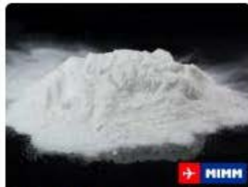
10.0g MDA - Reagent Tested $550.00