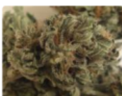
1/4 Bubba Kush $90.20