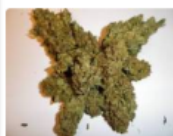
10g Amnesia Haze $194.77