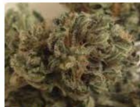
1/4 Bubba Kush $90.20