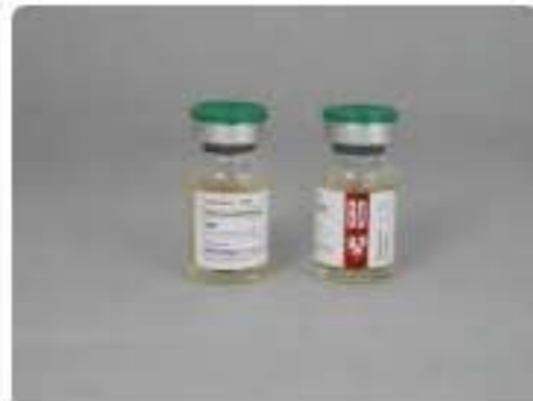
Boldabol 200 (B. Dragon), 10ml, 200mg/ml $66.11