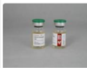
Boldabol 200 (B. Dragon), 10ml, 200mg/ml $66.11