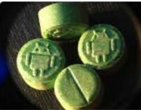
100x Green Android™ ( The New Mortal Kombat™ ) $547.65