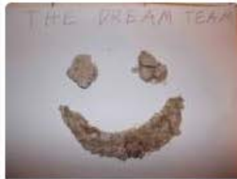
7 grams of PURE MDMA Moonrocks. $378.58