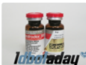
SCIROXX - Nandrodex 300mg/ml 10ml USA ONLY $114.21