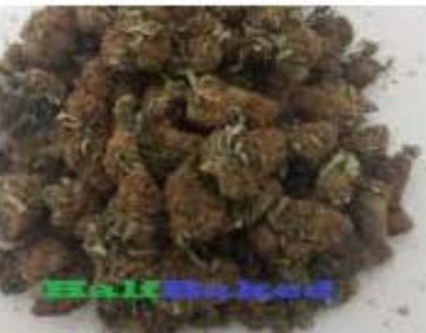
HYDRO BUDS 2G $40.00